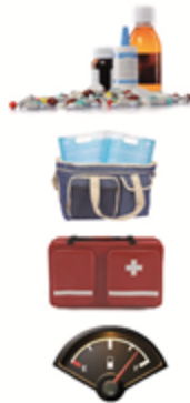
A minimum of one-week supply of critical medications and copies of all prescriptions