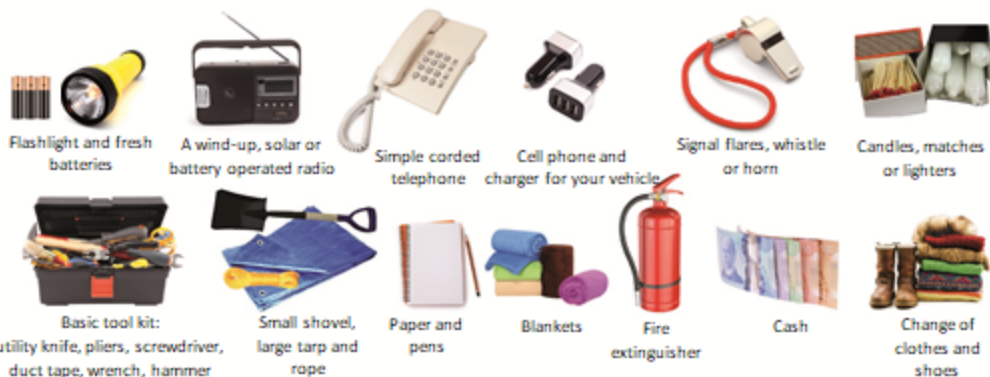
Flashlight and fresh batteries