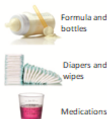
Formula and bottles