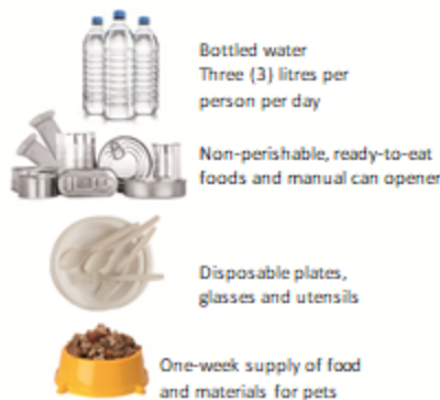
Bottled water Three (3) litres per person per day